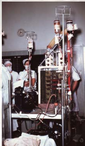
First Heart Lung Machine

The meeting is timed to occur at one of the busiest times in Melbourne's sporting and social calendar, Melbourne Cup week. The Melbourne Cup is the premiere horse race in the Southern Hemisphere. It is run on the first Tuesday in November, therefore Tuesday 6th is "Cup day" for 2007. It is a day when Melbourne and indeed all of Australia stop to watch the running of "the Cup". Thursday 8th of November is "Oaks day" or ladies day at the races. Visitors to Melbourne should take the opportunity to participate in the Melbourne's world famous Spring Racing carnival. Melbourne has the most live music venues in Australia and a burgeoning number of chic and groovy inner city bars for every level and style of socialising imaginable. Melburnians are also spoiled by the quality and range of gastronomic delights available to them. For the shop-a-holics Melbourne fashion is the envy of many, from the Paris end of town in ritzy Collins Street to the urban cool of Chapel Street in South Yarra. World smash hit theatre productions and "block-buster" art exhibitions also regularly visit Melbourne.